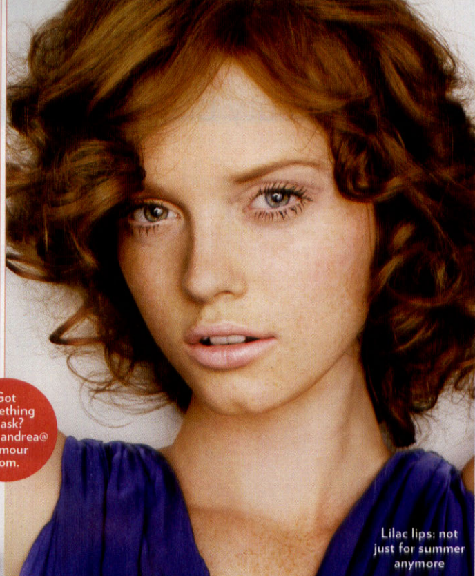
Lilac lips: not just for summer anymore