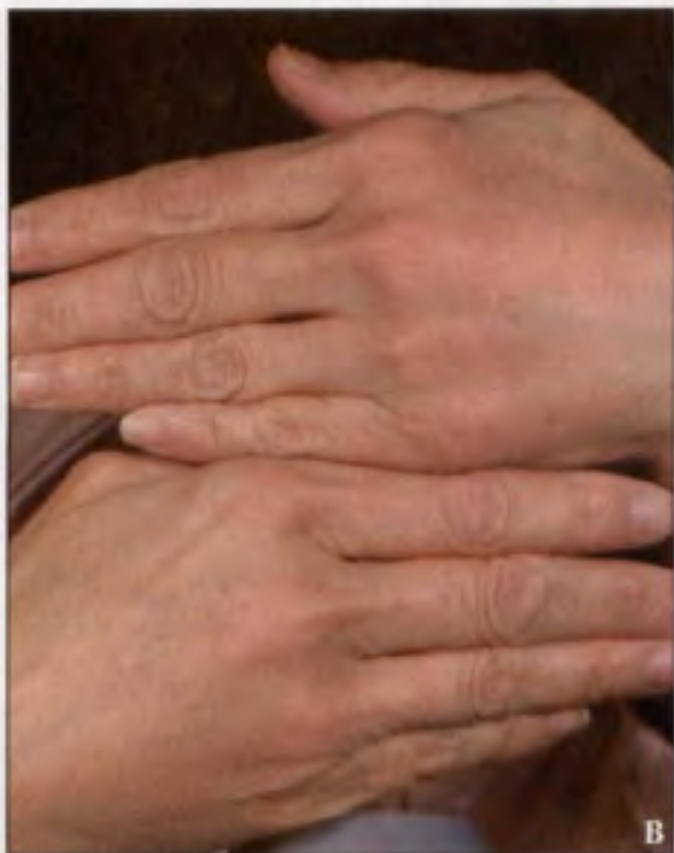
Figure 2. Hands before (A) and after treatment with calcium hydroxylapatite (Radiesse, Merz Aesthetics, Inc)(B).