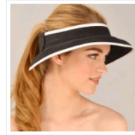
Fairway Fox Lily Visor