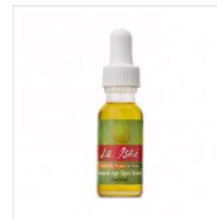
La Isha's Age Spot Eraser